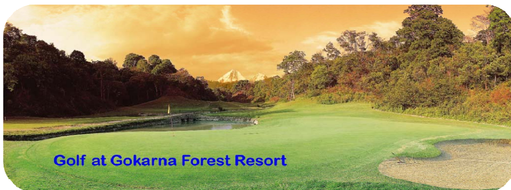
Golf at Gokarna Forest Resort

Golf Tour has specially designed for those who want to passionate play golf at Majestic Himalaya of Nepal. Nepal is not only destination for trekking adventures. Nepal is also an ideal destination for golfers . We have some famous golf courses that provide excellent opportunity to play in the tranquil natural beauty and in the back drop of spectacular Himalayan panorama.